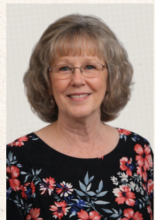
Pauline Kesler Rally Photographer