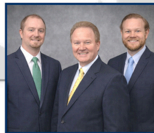
Sons of Liberty